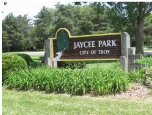
City of Troy Jaycees Park