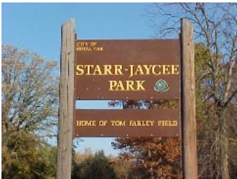
Royal Oak Jaycees Park