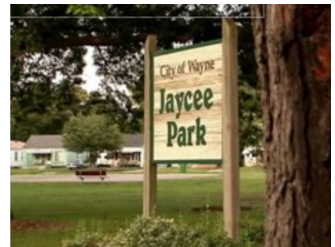
City of Wayne Jaycees Park